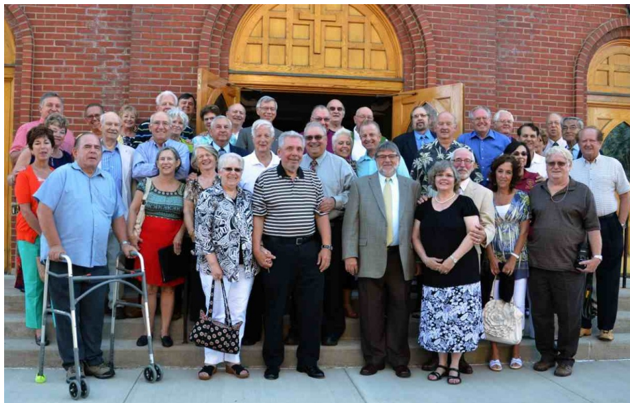
Group Photo at Our Lady of The Lake

Alumni Newsletter for St. Anthony of Padua Alumni Vol. 5 No.2 October 2012