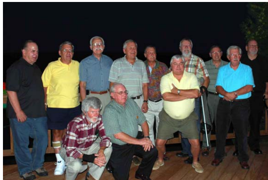
Class of 1960 Group Photo