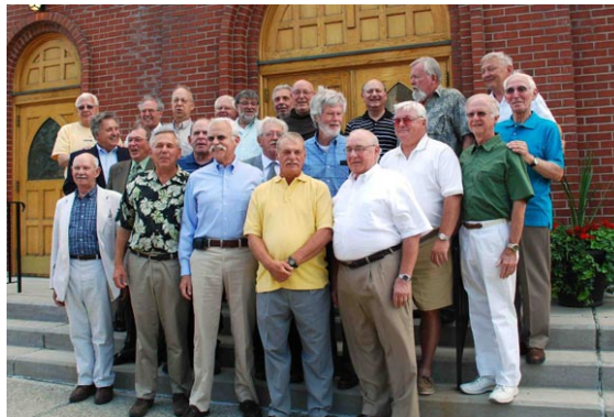
Reunion Group Photo after Mass